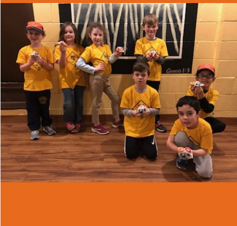
Games Tigers Play

March 28 – Good Knights Den Outing to Cradles to Cravons